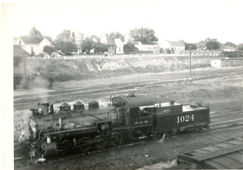
KCS No. 1024 in rail yard with Maple St. in background (1939)