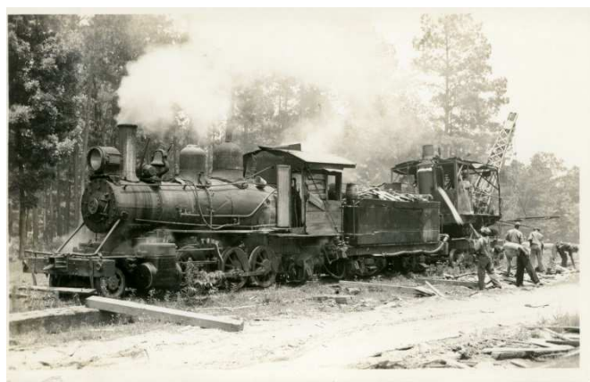
Logging railroad Hiller-Edward-Fuller No. 5 (1941)