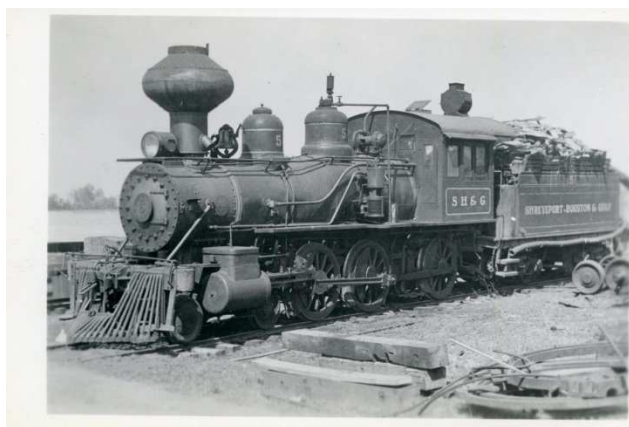
Shreveport Houston & Gulf No. 5 (1938)