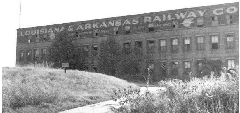
Commerce St. View